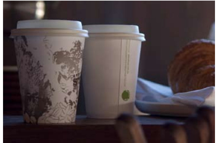
Custom printed and plain 8oz cups and lids